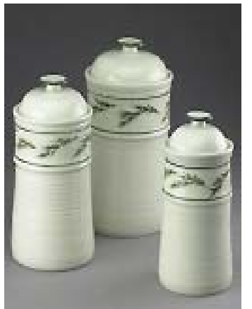
Three Piece Canister Set with Pine Design

liquefied clay. After a low firing which hardens each pot, they are embellished with a pattern and covered with a clear glaze before they are high fired in a gas kiln to 2,232 degrees. Each piece is now sealed behind a durable finish, giving her pottery its elegant, shiny finish. The high firing creates a beautiful, functional piece which is ovenproof, microwave safe and, of course, lead free.